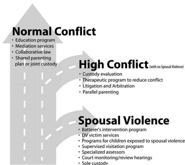
FIGURE 2 Differential intervention strategies in child custody disputes.

conferences have the potential to endanger victims or intimidate them into accepting parenting arrangements, such as co-parenting, which may pose a risk to their safety or the safety of their children.